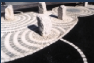
Oxbridge Home Zone, Les Bicknell